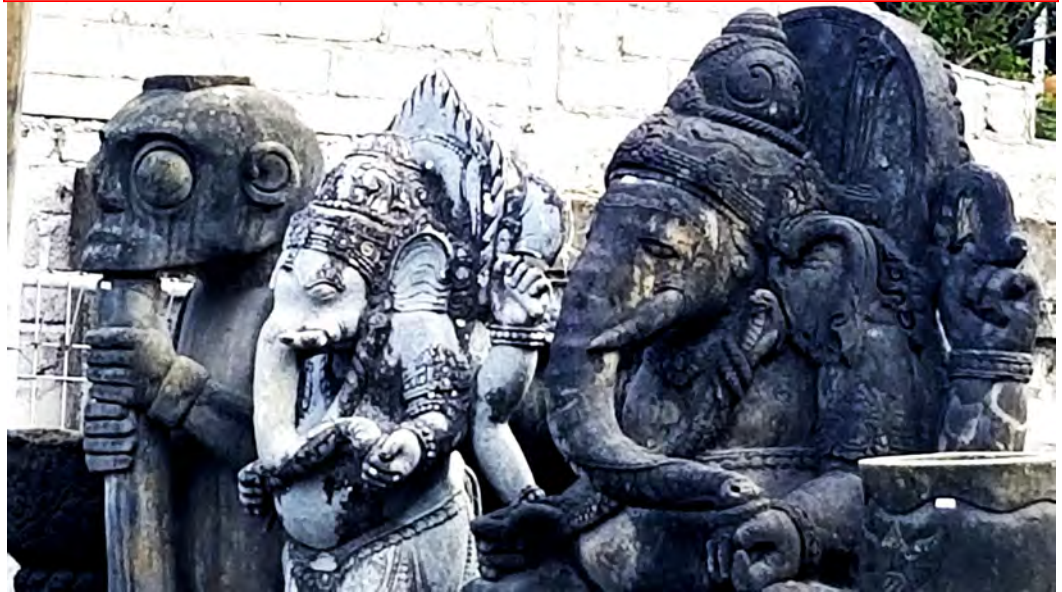
"Gods of Stone"

"...and changed the glory of the incorruptible God into an image made like corruptible man—and birds and four-footed animals and creeping things."