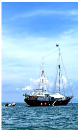
NATIVA, Serangan anchorage, Denpasar City.

"She and others like her are persons of our concern..."