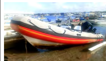
The BARACUDA on the beach for cleaning in July.

"I cannot recall a single person who wasn't happy to receive what we offered..."