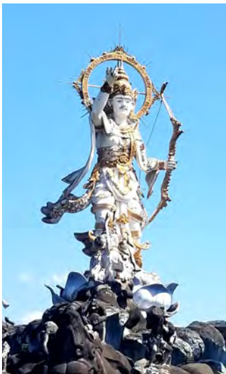
"Rama" of the Hindu pantheon, the 7th incarnation of Shiva; One of many shrines to the mythical god. Pray for these people.

"For him and others like him, we will carry on in gospel ministry in this place."